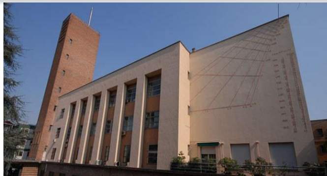
Viale del Risorgimento, 2, 40136 Bologna BO